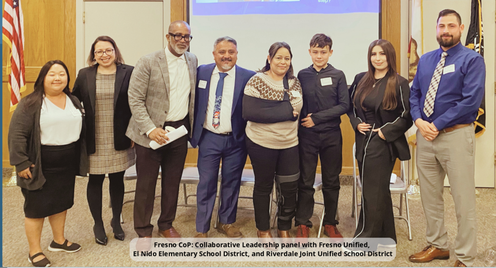
Fresno CoP: Collaborative Leadership panel with Fresno Unified, El Nido Elementary School District, and Riverdale Joint Unified School District